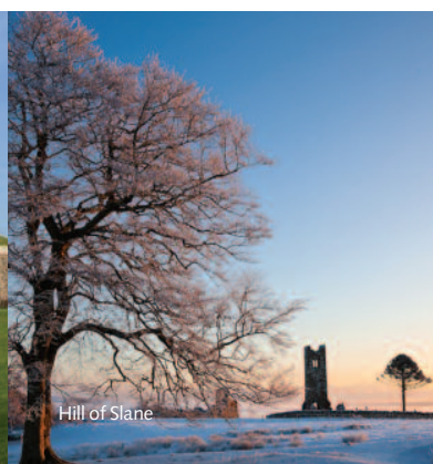
Hill of Slane