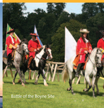
Battle of the Boyne Site